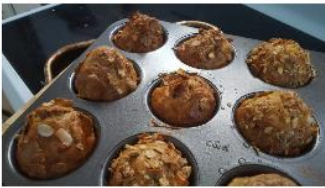
Muesli Breakfast Muffins can be the perfect breakfast alternative

Here's some cereal alternatives for kids who just can't face a bowl of oats & milk!