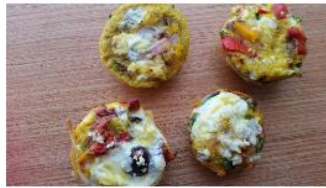
Eggy Muffins are a perfect bite sized nutritious breakfast & any favourite fillings can be used.