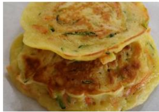
Veggie Pikelets can be baked ahead & leftovers stored in the freezer ready for breakkie!