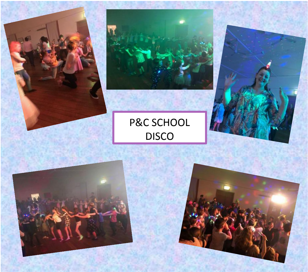
P&C SCHOOL DISCO