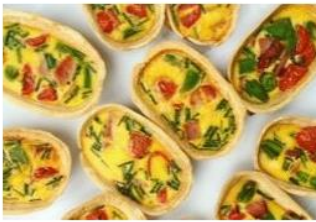
Breakfast Boats freeze well & can be grabbed & quickly eaten on the go